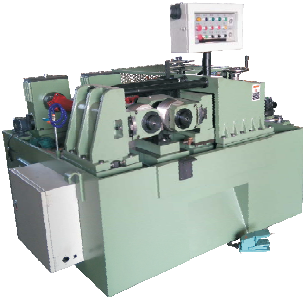
BAR/ROD THREAD ROLLING MACHINE (CYLINDRICAL/HYDRAULIC TYPE)