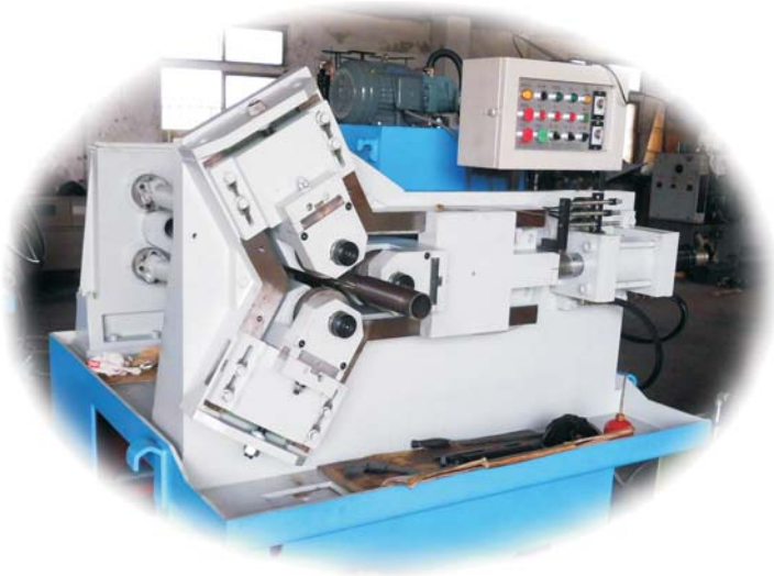
PIPE THREAD ROLLING MACHINE